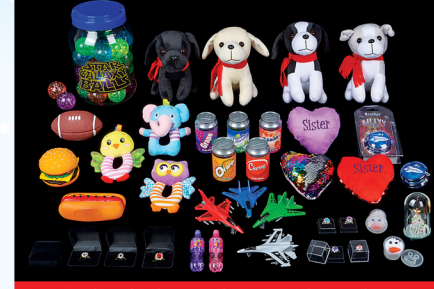
GIFTS FOR: KIDS • FRIENDS • PET