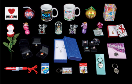
GIFTS FOR: MOMS • GRANDMAS • AUNTS