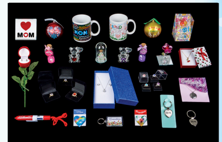
GIFTS FOR: MOMS • GRANDMAS • AUNTS