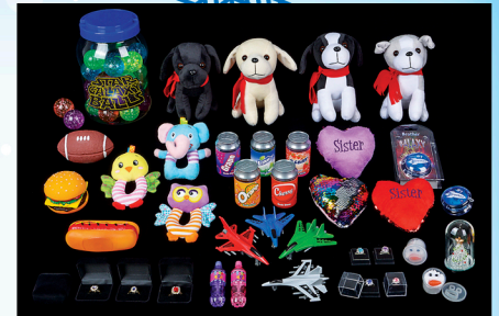
GIFTS FOR: KIDS • FRIENDS • PETS